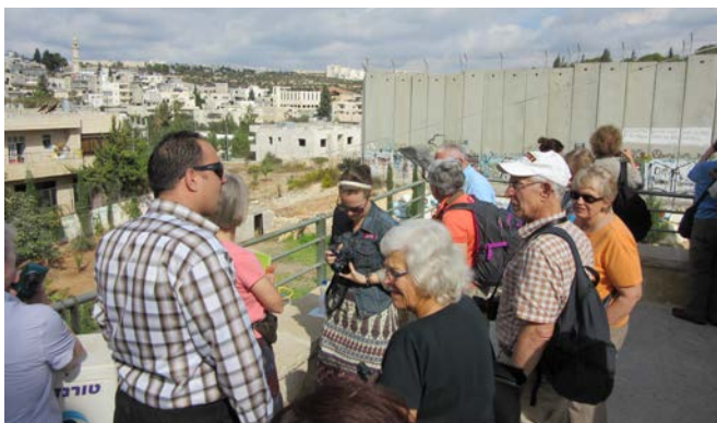
Group members in Bethlehem, overlooking Wi'am playground, Separation Wall, Aida Refugee Camp, and Gilo Settlement