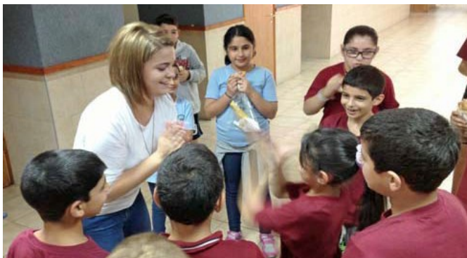
Meet the Living Stones of Israel/Palestine