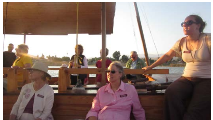
Boat ride in a small boat on the Sea of Galilee