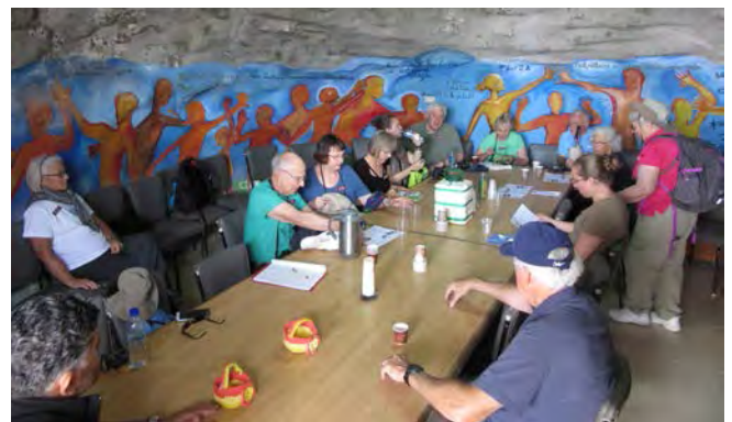
Visit leaders and organizations working for a Just Peace for all God's children -- here in 2014 at Tent of Nations

Early-bird Registration Deadline: 10 July 2015 $500 due with registration; $1295 due by 1 Sept. 2015 After 10 July, add $50/person