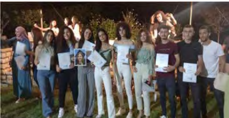
Mar Elias Students – Weizmann Institute Graduates