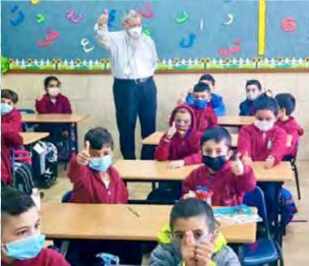
Mar Elias Educational Institutions - MEEI Teachers and Administrators