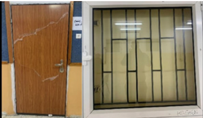
Safe Room Improvements

We reached our goal! Thank you for your generous support!!!