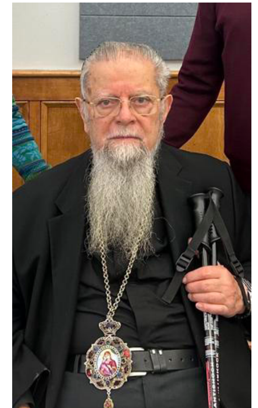
Yours Fraternally, Abuna Elias Chacour Archbishop em. of Galilee

Yours with deep friendly relations and daily prayers for all of you,